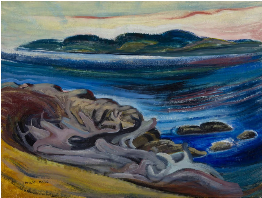
Emily Carr, Shoreline , around 1936

Emily Carr, arguably Canada's most famous woman artist, was well represented with seven works on offer in the sale. Shoreline (around 1936), an oil composition set on the Pacific coast that was her stomping ground for most of her life, surpassed its high estimate to sell for C$901,250 ($650,000). Another landscape, the work-on-paper British Columbia Forest , realised C$541,250 ($390,000), more than double its low estimate.