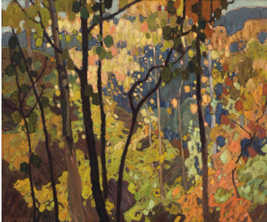
Franklin Carmichael, Leaf Pattern, 1922

University Club of Toronto's collection and had made quite a splash 99 years earlier, when it earned Harris a gold medal at the 1926 Sesqui-Centennial Exposition in Philadelphia. The next year it was featured in an exhibition of Canadian art at the Musée du Jeu de Paume in Paris.