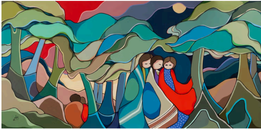
Daphne Odjig, Awakening of Spring , 1985

And in the Canadian, Impressionist and modern portion of the sale, Helen McNicoll's Happy Moments garnered C$229,250 ($165,300), more than three times its high estimate.