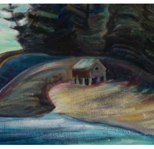
detail lot 110

conflicting sense of vulnerability yet determination, as she continued on the difficult path of searching and experimenting.