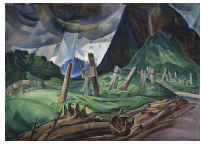
FIGURE 1: EMILY CARR Vanquished oil on canvas, 1930 36 × 50 in, 92 × 129 cm Collection of the Vancouver Art Gallery

When Carr conjured the power of the elements in this painting, she was at a critical point in her career. Her image of forest and shoreline looks back with yearning to the adventurous journeys she had made in the past three years to northern First Nations villages. Those experiences had inspired a prodigious outpouring of monumental paintings such as Indian Church from 1929 (collection of the Art Gallery of Ontario) and Vanquished from 1930 (collection of the Vancouver Art Gallery, figure 1), in which she represented the villages and totem poles with studied geometric and Cubistic forms and gave them dark, stylized forest