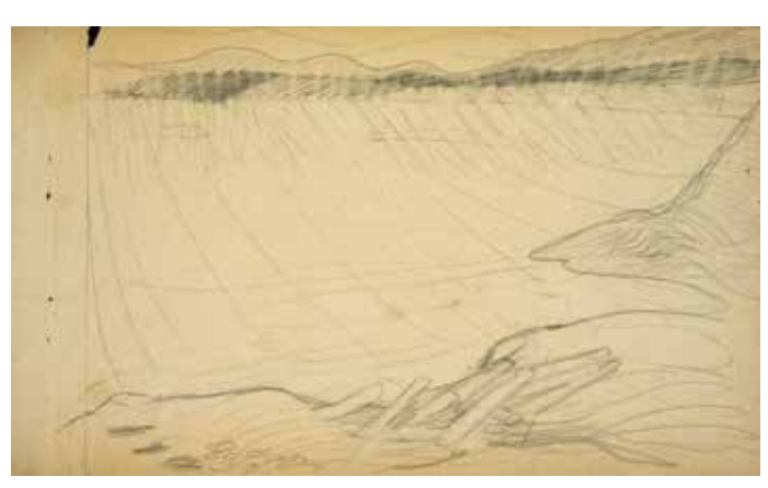
FIGURE 3: EMILY CARR Seascape graphite on paper 5\% \times 9\% in, 15 \times 23.1 cm Collection of the Royal BC Museum, PDP05633