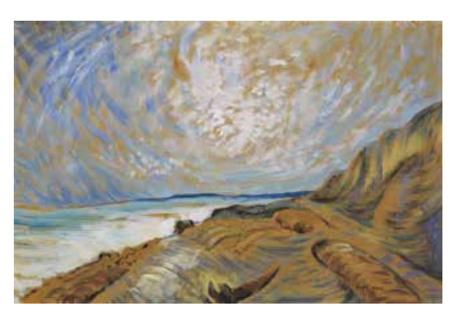
FIGURE 2: EMILY CARR Across the Straits oil on paper on board 23 × 35 in, 58.4 × 88.9 cm Private Collection