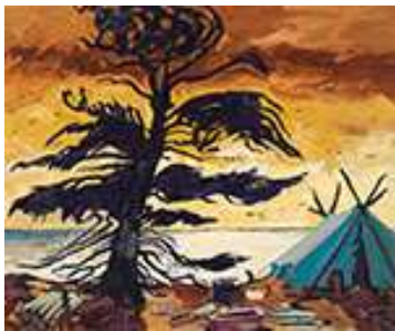
316 Bruno Cote Campement, rivière Mingan

oil on canvas 36 x 40 in, 91.4 x 101.6 cm ESTIMATE: $4,000 - 6,000