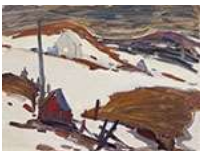
029 René Jean Richard Paysage

oil on canvas 8 x 10 in, 20.3 x 25.4 cm ESTIMATE: $800 - 1,200