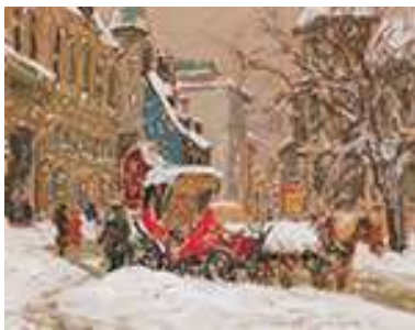
004 Horace Champagne Un tour de calèche?

oil on canvas board 16 x 20 in, 40.6 x 50.8 cm ESTIMATE: $1,200 - 1,600