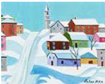
027 Claude Picher Gaspesian Village

oil on board 8 x 10 in, 20.3 x 25.4 cm ESTIMATE: $800 - 1,200