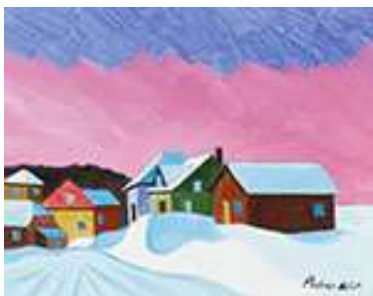
028 Claude Picher End of the Day

oil on canvas 8 x 10 in, 20.3 x 25.4 cm ESTIMATE: $800 - 1,200