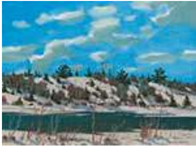
002 Bruno Joseph Bobak Lower St. Mary's

oil on canvas 24 x 30 in, 61 x 76.2 cm ESTIMATE: $1,500 - 2,500