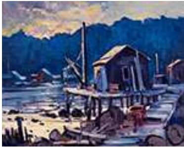
314 Bruno Cote Fin du jour, N.S.

oil on canvas 9 x 10 5/8 in, 22.9 x 27 cm ESTIMATE: $1,000 - 1,500