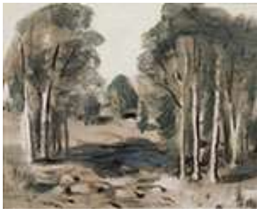
313 Stanley Morel Cosgrove Sous-bois en brun

oil on canvas 9 x 10 5/8 in, 22.9 x 27 cm ESTIMATE: $1,000 - 1,500