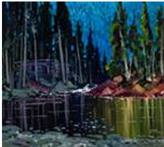
315 Bruno Cote La chute du camp

oil on board 24 x 30 in, 61 x 76.2 cm ESTIMATE: $3,000 - 5,000