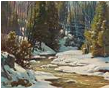
003 Frederick Henry Brigden Winter Stream

oil on canvas 12 x 16 in, 30.5 x 40.6 cm ESTIMATE: $1,500 - 2,000