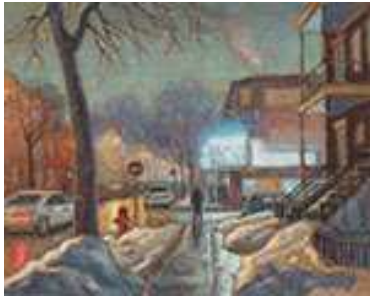
001 Antoine Bittar Cinema Beaubien, Montreal

oil on canvas 24 x 30 in, 61 x 76.2 cm ESTIMATE: $1,500 - 2,500