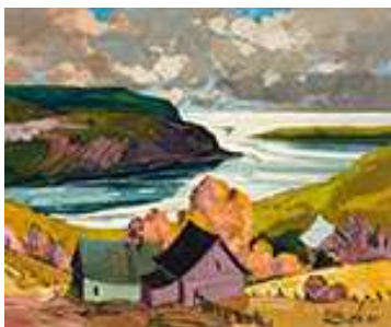
317 Bruno Cote Cap aux Corbeaux

oil on board 20 x 24 in, 50.8 x 61 cm ESTIMATE: $3,000 - 5,000