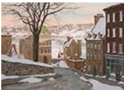
005 Horace Champagne Rue de la Montagne

pastel on paper 8 x 10 in, 20.3 x 25.4 cm ESTIMATE: $1,000 - 2,000