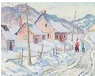
026 Gordon Edward Pfeiffer Winter Scene

oil on board 8 x 10 in, 20.3 x 25.4 cm ESTIMATE: $800 - 1,200