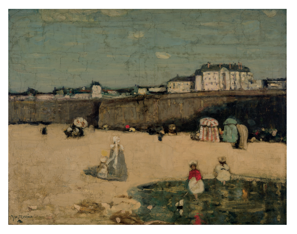
ABOVE: JAMES WILSON MORRICE La plage oil on canvas, circa 1898 – 1899 28 ¾ x 36 ¼ inches Sold December 2, 2020 for $1,141,250

with an additional donation of $25,000, provided directly to the food centres. Each and every bid placed helped raise the overall donation total to an amazing $225,888 for these deserving organizations.