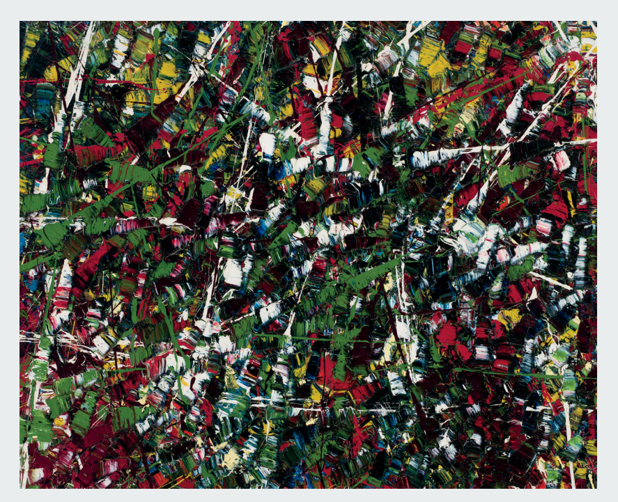
ABOVE: JEAN PAUL RIOPELLE, Sans titre oil on canvas, 1953 31% × 39½ inches Sold December 2, 2020 for $1,441,250