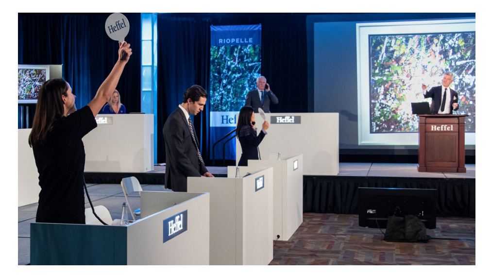
ABOVE: Heffel's Fall Live Auction, December 2, 2020, Heffel's Digital Saleroom