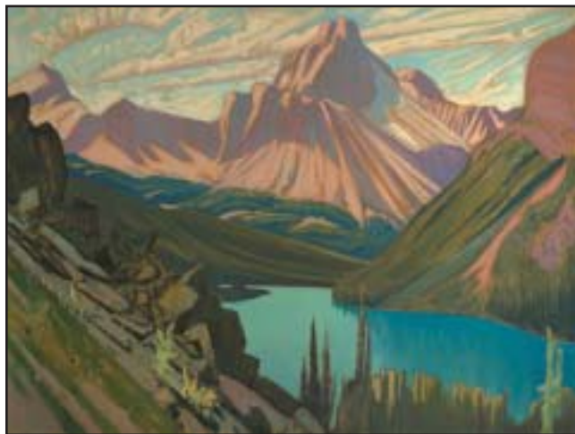
J.E.H. (JAMES EDWARD HERVEY) MACDONALD G7 OSA RCA 1873 - 1932 Lake O'Hara and Cathedral Mountain, Rockies ESTIMATE: $400,000 ~ 600,000; SOLD FOR A RECORD $977,500