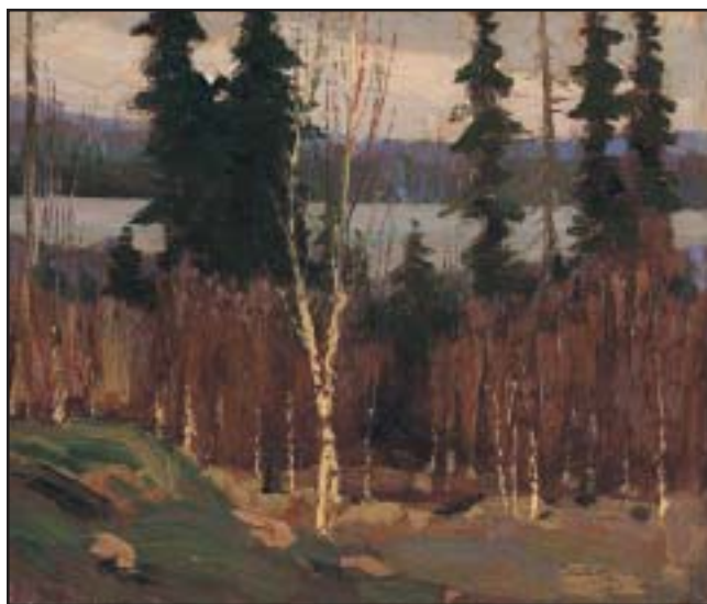
TOM (THOMAS JOHN) THOMSON G7 OSA 1877 - 1917 South Shore of Canoe Lake, Algonquin Park ESTIMATE: $180,000 ~ 220,000; SOLD FOR A RECORD $460,000