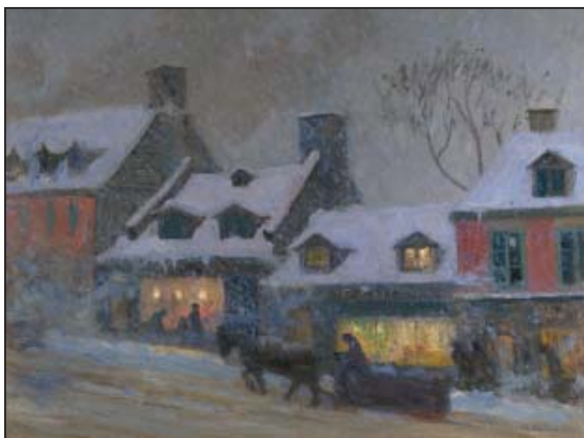
MAURICE GALBRAITH CULLEN

28 Works Each Sell for Over $100,000; Plus 18 Records Set