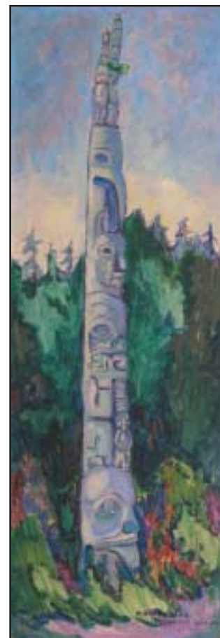
EMILY CARR BCSFA RCA 1871 - 1945 Chatle, Q.C.I. ESTIMATE: $175,000 ~ 225,000; SOLD FOR $431,250