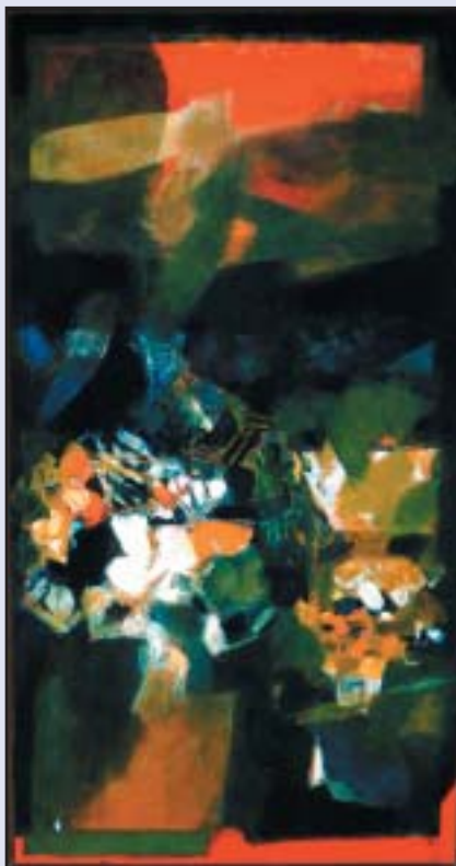
SAYED HAIDER RAZA