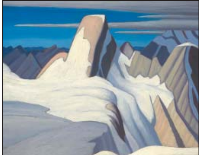
LAWREN STEWART HARRIS